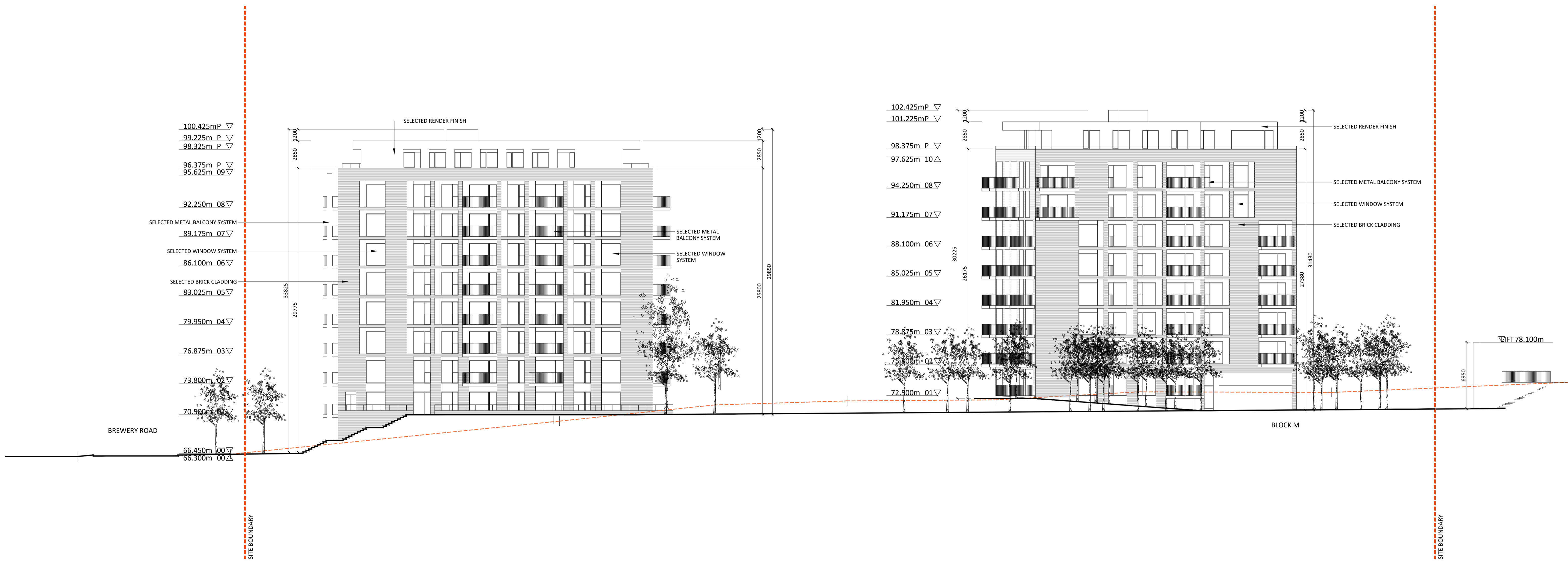
Southwest Elevation (Blocks J & M)